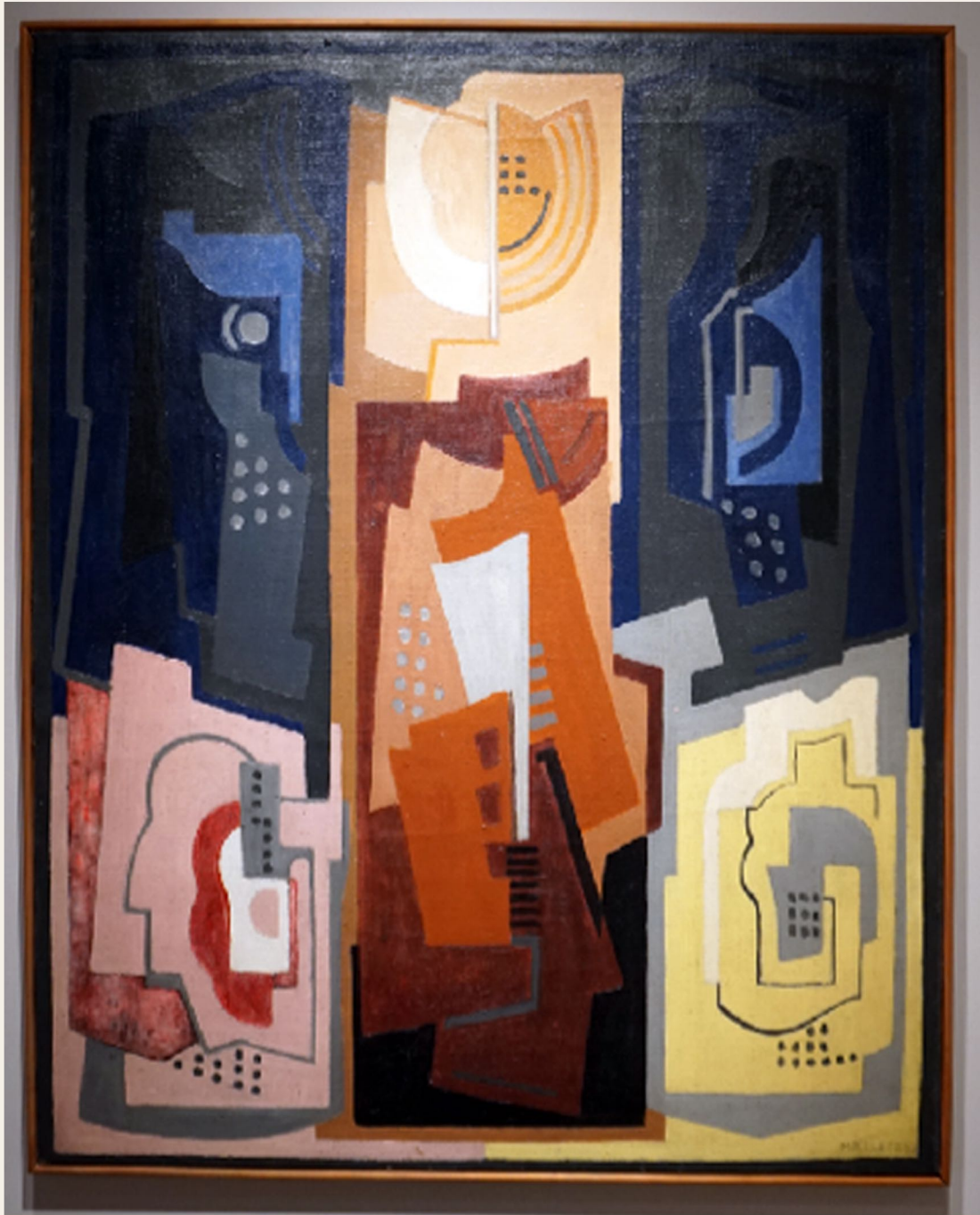
'6 Elements', 1926 Mainie Jellett (1897 - 1944)) Oil on canvas, 106 x 83.8cm, On loan from private collection.